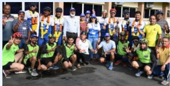
Glimpses of Cycle rally held on 20 th August 2022.