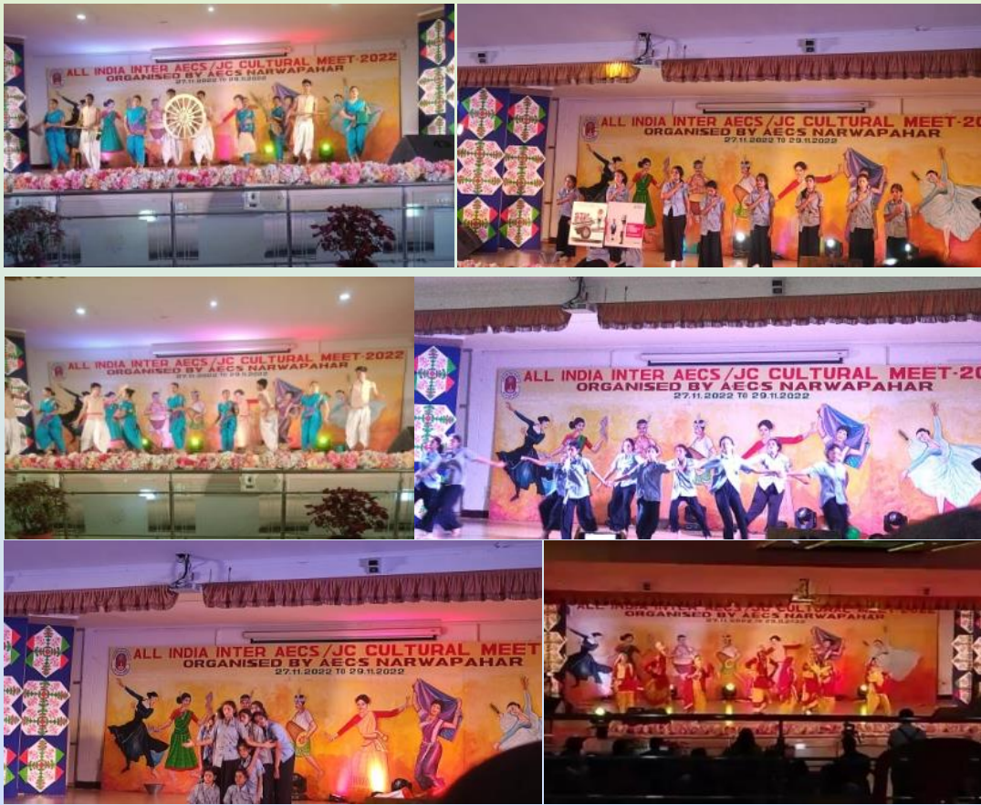
Glimpses of dances performed in All India Inter AECS/JC Cultural Meet-2022 held at AECS Narwapahar

All India Inter AECS/JC Cultural Meet was organized at AECS, Narwapahar on 27 th to 29 th November 2022. The students of our school participated in both junior and senior category. Both the groups made us proud by their spectacular performances at the cultural meet. The students of junior category brought another laurel to our school by winning the first position in All India Inter AECS/JC Cultural Meet. This is the first time AECS Kakrapar is getting a prize in Dance Competition.