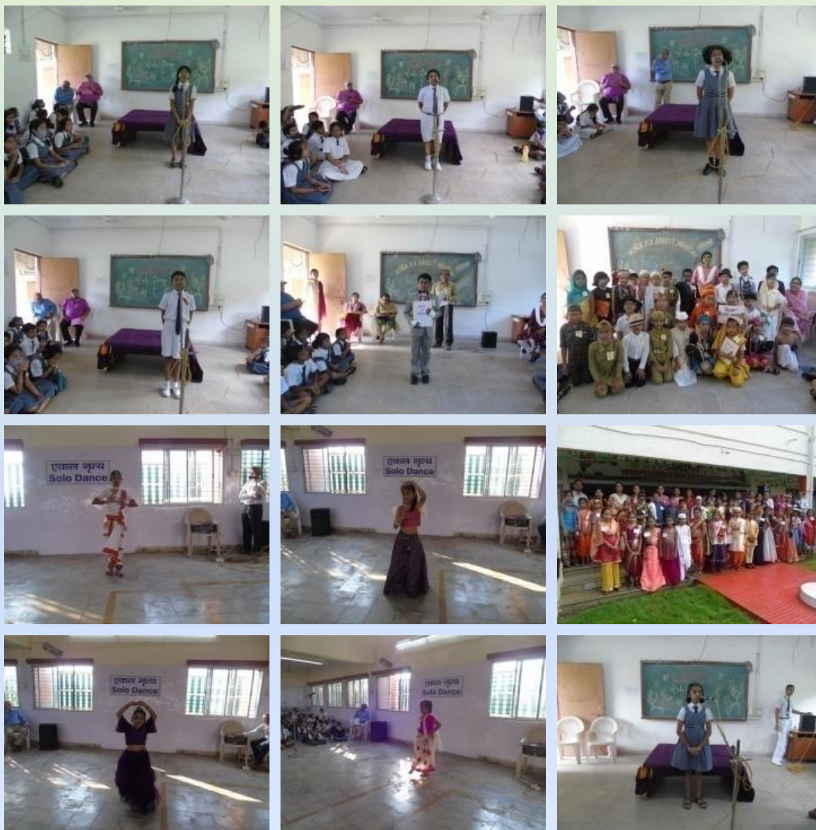
Glimpses of CCA conducted in primary section

In the present session 2022-2023, the CCA committee organized various activities for the students of classes I to V. In the primary section, nearly 8 co-curricular activities were conducted. There were many new activities like stone colouring, declamation, mono acting, clay molding, fancy dress, solo dance and solo song competitions, etc. which were liked by all the students. The winners were awarded the certificates on 20 th January 2023 at CCA Day Celebration and cash prizes in their bank accounts.