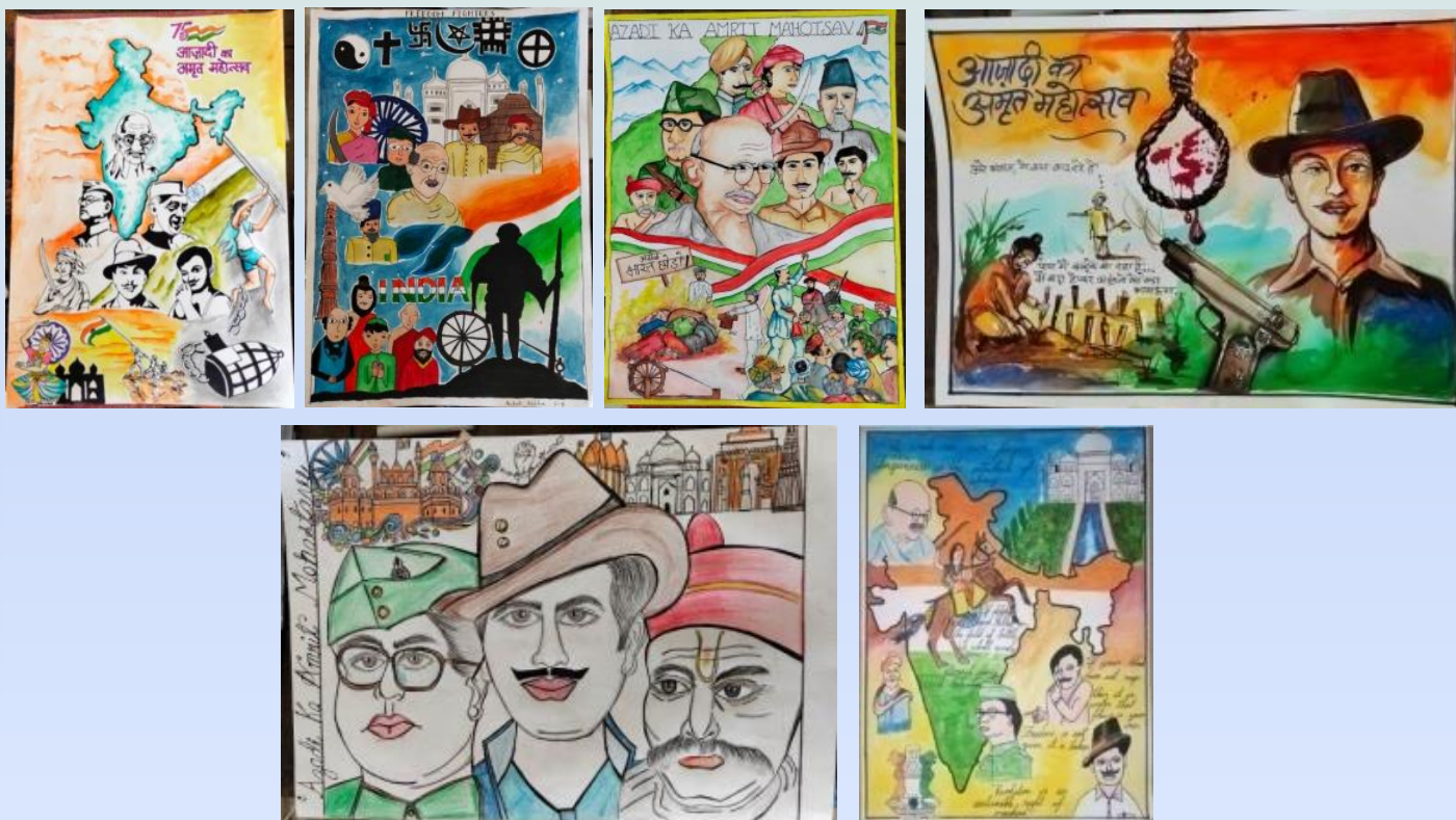
Glimpses of Poster Making Competition under AKAM.

Students could participate in the activities, ensuring all Government guidelines regarding COVID-19, through online and offline classes as and when informed by the teacher concerned in the class core groups.