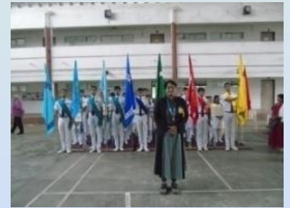
Glimpses of investiture ceremony