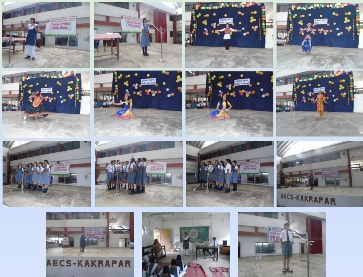
Glimpses of CCA of secondary section.

In the present session 2022-2023, the CCA Committee organized a plethora of activities. In the secondary section, eleven activities were organized and conducted successfully. All the activities gave ample opportunities to students for participation. There were many new activities such as Paper Reading Competition, Art Competition, Solo song, Group song, Solo Dance, Group Dance Flower/Salad Decoration, Flower Rangoli, Vegetable Carving, English Essay Writing and English Elocution competitions, Theme Based Story Writing, etc. The winners of different competitions were awarded certificates on 21 st January 2023 at CCA Day Celebration and prize amount was credited in the students' bank accounts.