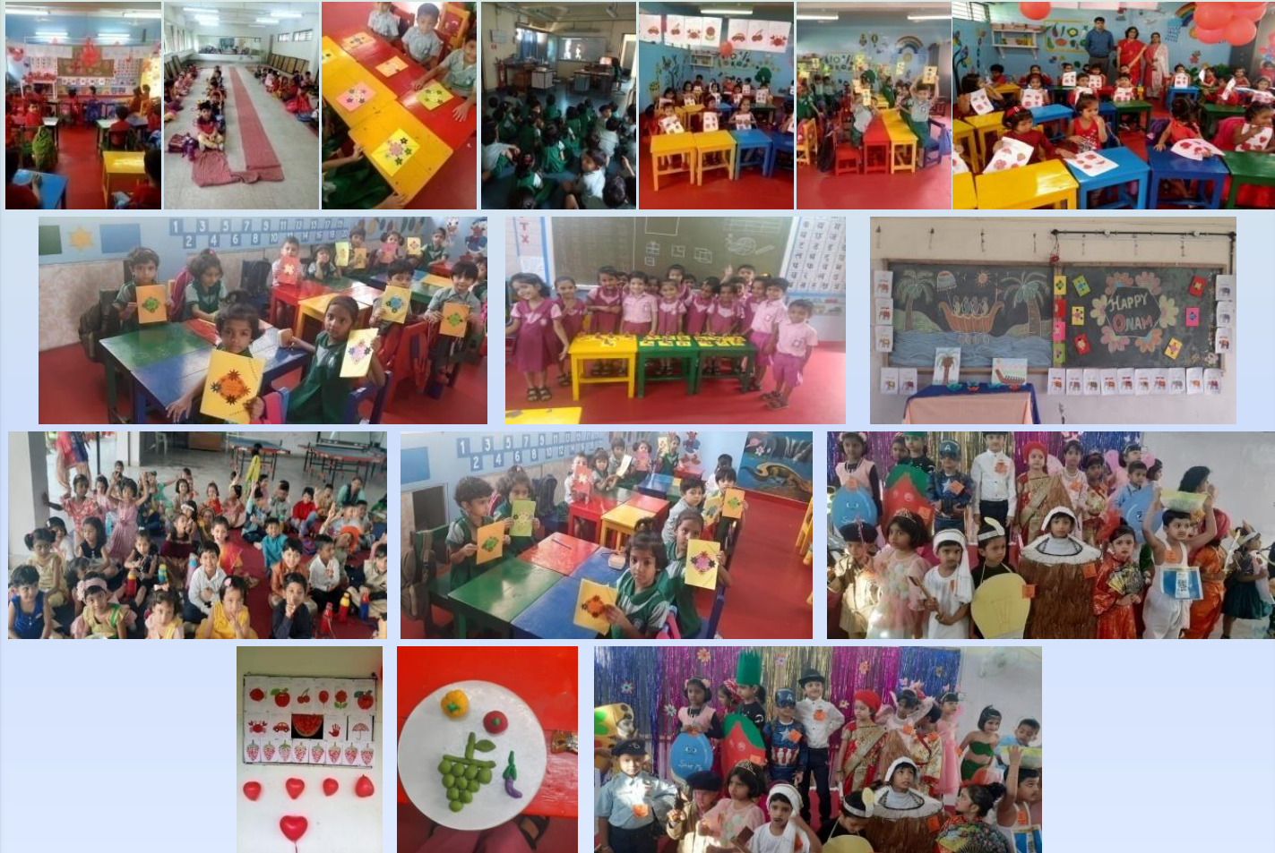
Glimpses of Pre-prep and Prep activities.

Different activities were planned and conducted by the prep teachers for the students of classes Pre-prep and Prep. Activities like readiness activity, pre-mathematical concepts, rhymes, creative activities, etc. In the month of July, Red Colour Day was conducted for the tiny tots of Pre-prep and Prep. In the month of August, Raksha Bandhan was celebrated. Children enjoyed it and learned its importance. In the month of September Onam and Dussehra festivals were celebrated. The significance of the festival was taught to the children. Diwali celebration was held in the month of October, students made beautiful cards, lanterns and also painted the earthen diyas under the guidance of the teachers. In addition to these activities, greeting card making, dandiya making, stick puppet making was also taught to the students. Students participated actively and made crafts in the school and homes as well. Fancy Dress Competition was also conducted for classes Pre-prep and Prep.