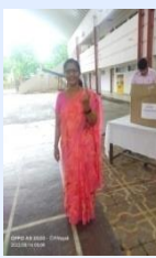
Glimpses of election held for various school appointees for the session 2022-23